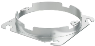
MSC8766 Mud-in Ring

Thin discs of evenly illuminated LED create the impression of recessed lighting. The die-cast aluminum housings are available in White, Black, Satin Nickel, and Polished Chrome all with a thoughtfully recessed White polycarbonate diffuser. High efficiency and good color rendering make this a perfect choice for your next project.