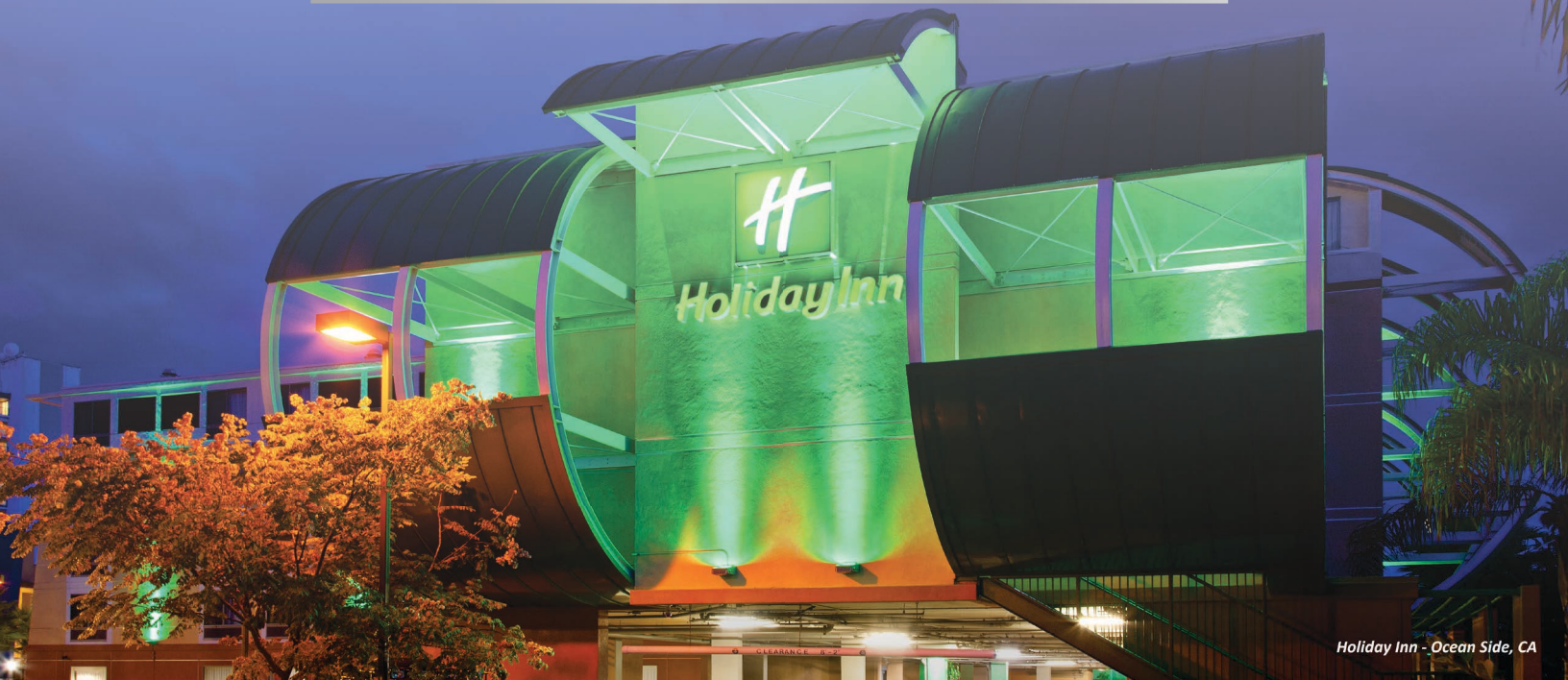
Holiday Inn - Ocean Side, CA