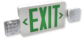
NEX-712-LED/G Green Letters / White Housing