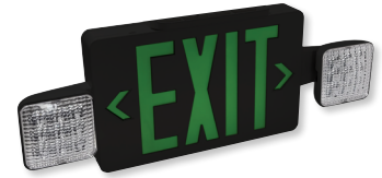
NEX-712-LED/G Green Letters / Black Housing