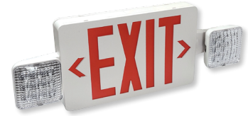
NEX-712-LED/R Red Letters / White Housing