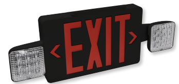
NEX-712-LED/RB Red Letters / Black Housing