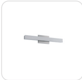
WS24-040-BN Brushed Nickel