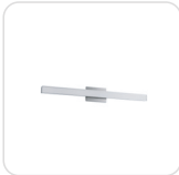
WS36-040-BN Brushed Nickel