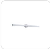
WS36-044A-BN Brushed Nickel